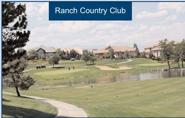
Ranch Country Club