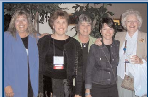
CMGMA Pediatric Managers